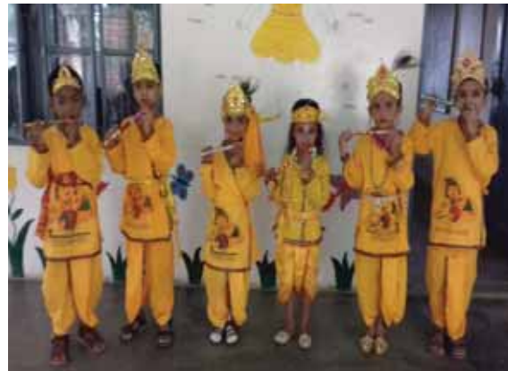
Flag Hoisting in the school and cultural programme on Independence