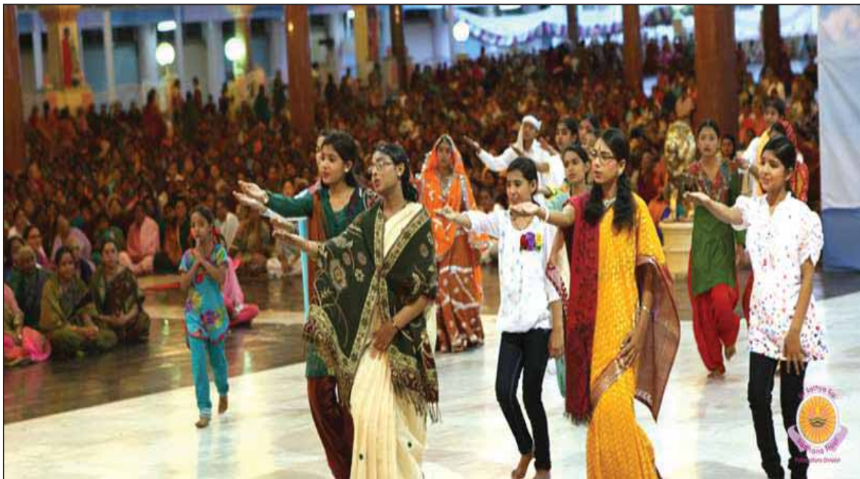
The cast of the drama "Love All Serve All" praying to Bhagawan (06-05-2013) at Prasanthi Nilayam