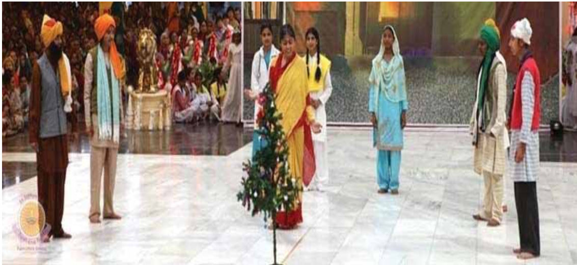
A scene from "Sarva Dharam Saroopa Sai" presented on 30-12-2011 (Prasanthi Nilayam)

The School has prepared and staged two quality dramas in the hallowed precincts of Prasanthi Nilayam: