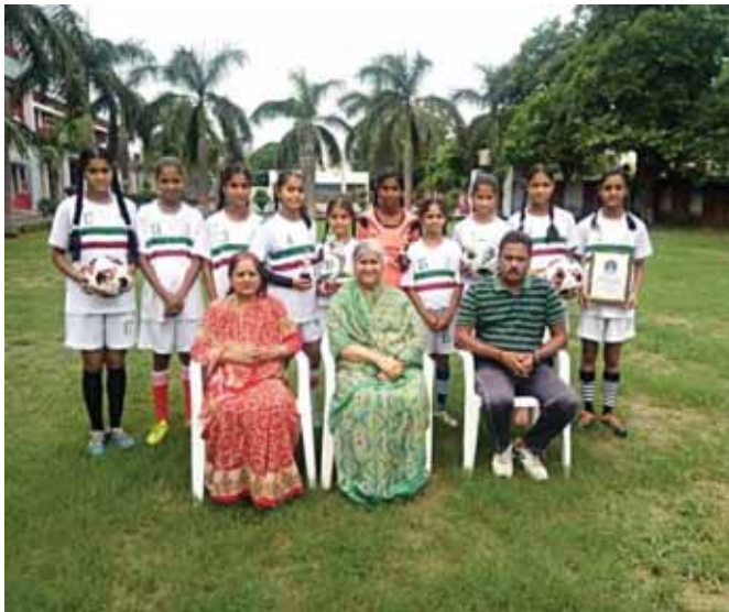
District Champion Girl's Football team