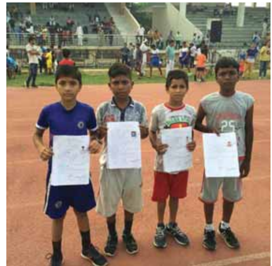
State level participation in 400 meters relay race