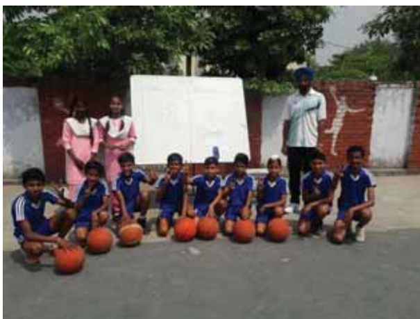
Junior District Basketball team with their coach