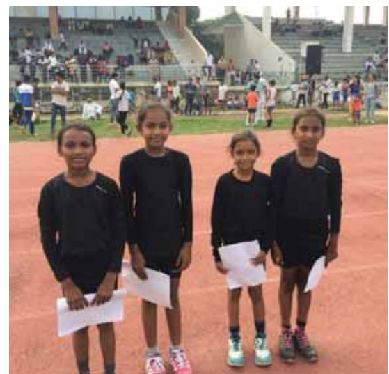
State level participation by girl's 200 meters relay race team