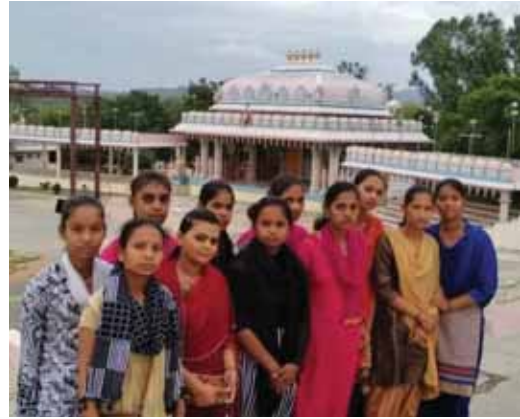
Boys meditating under the Vat Variksha (PN) & the group girls in Hill View stadium